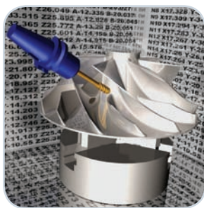
Impeller machining with Pro/ENGINEER

With Pro/ENGINEER Complete Machining, manufacturing engineers can work concurrently with designers to automatically incorporate design changes. With this integrated collaboration between two fundamental areas of development, you have the power to increase product quality, reduce scrap and decrease production time and costs.